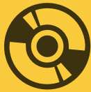
Blu-ray Disc™ Player