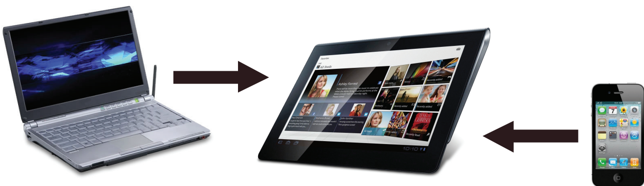
Figure 1: Processors used in media tablet applications are mainly driven by notebooks and smartphones.

Since the Lattice solution is based on a flexible FPGA architecture, other solutions such as frame buffer, image rotation, downscaling using different algorithms, upscaling, and other color space converters can also be implemented.